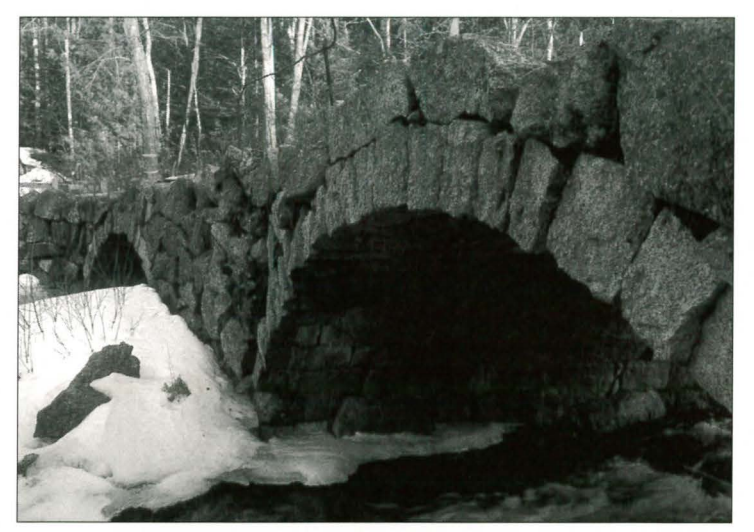
Above: The double-arched Carr Bridge in Hillsborough, New Hampshire, is a remarkable example of dry masonry stone work. A double-arched bridge allows for the necessary volume of water to flow through and still keeps the height of the bridge consistent with the roadbed. The granite was probably cut from deposits right by the river.

New Hampshire townships, the basic units of government in New Hampshire, are filled with dispersed farmsteads and homes. Nearly every township has somewhere within it a town hall, a place where the inhabitants gather one or more