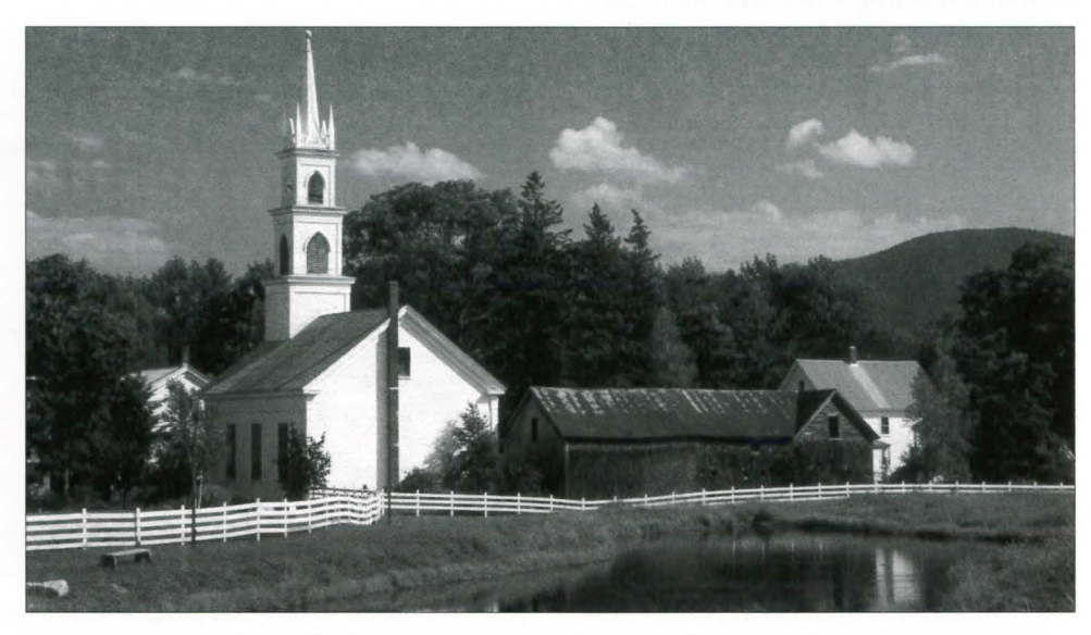
Located northeast of Lake Winnipesaukee, the town of Tamworth has a beautiful complex of typical 18th-century buildings, including a town hall and a church. The Remmick Country Doctor Museum, with its historic farm buildings, adds to the historic character of the town.

Over nearly 400 years, with immense human labor and ingenuity, New Hampshire people have transformed their natural environment. Settlers in the 17th century began the generations-long task of subduing the forest, making wood products our first great export. New Hampshire pine supplied masts for the