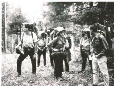
Peace Corps volunteers undergo field training in New Mexico before starting their two years of service in Brazil.