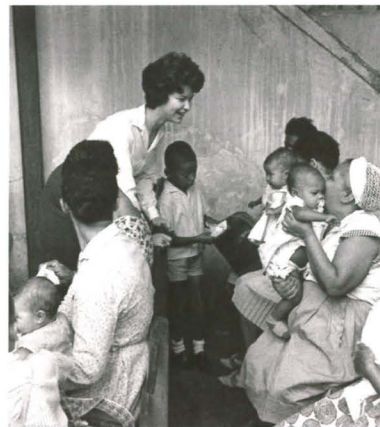
A Peace Corps volunteer meets members of her community in Brazil.