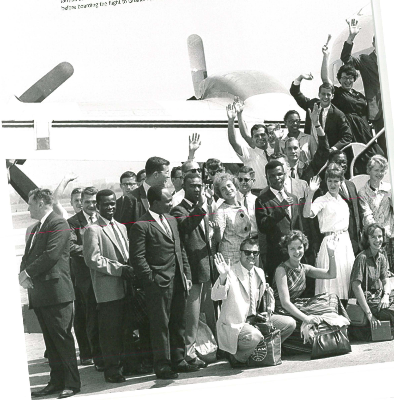
The first Peace Corps volunteers to travel overseas pose on the tarmac at Washington's National Airport, August 29, 1961, shortly before boarding the flight to Ghana.