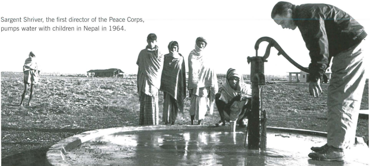
Sargent Shriver, the first director of the Peace Corps, pumps water with children in Nepal in 1964.

country who naively believe that their ingenuity, strength, and moral values will inevitably make the world a better place for all humankind.