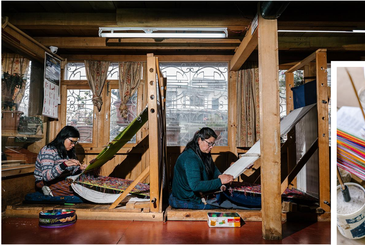
Handmade in Armenia, My Armenia program USAID and Smithsonian CFCH